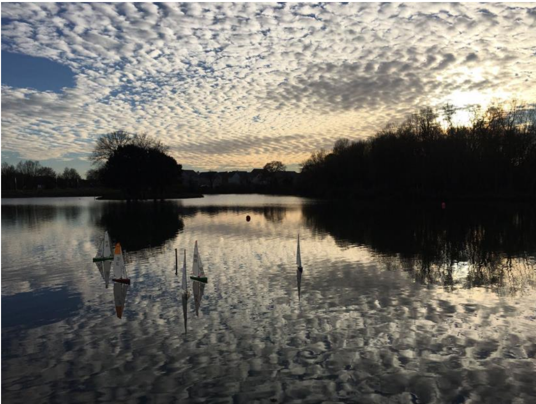
“Sunset at RC Boats”