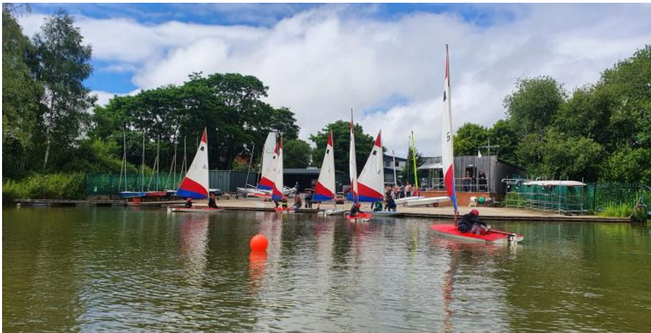
“Busy Club”