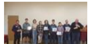
1 This years' award winners at the trophy presentation