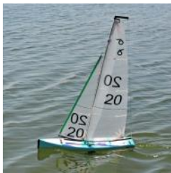
RG65 Swing Rig

The design of an RG65 can be tuned to suit the prevailing conditions where you sail, for example open water conditions or light wind inland sites. It is also possible to home build although the 'professionals' will most likely sail professionally built boats.