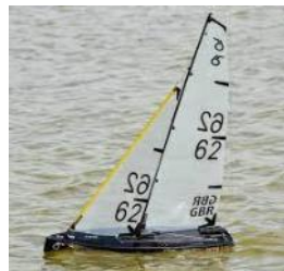
DF65 Std Rig

The DF65 emerged around 10 years ago developed from an RG65 design as an off the shelf value for money racing yacht. It is a tightly controlled one design yacht which must be sailed in an unmodified form as purchased from the manufacturer, however it fits into the RG65 rule book with one major exception, it can have 4 rigs A+, A,B,C.