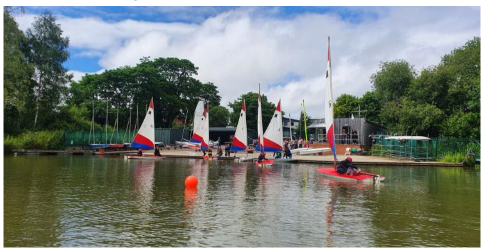
"Busy Club"